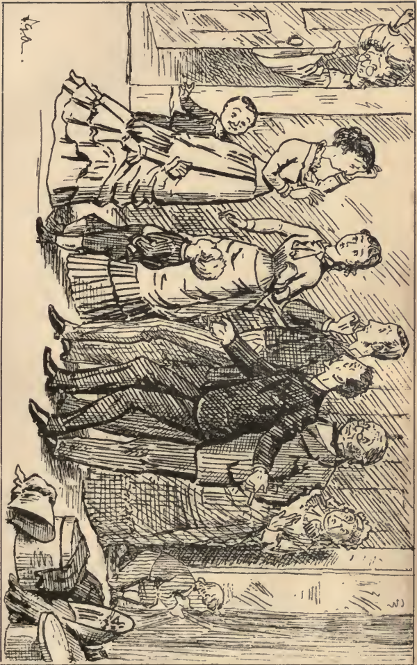
The Seterkins' Charades.